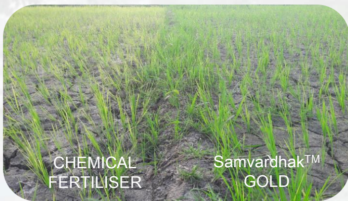
* Real photograph from farmer's field when Samvardhak™ GOLD was used